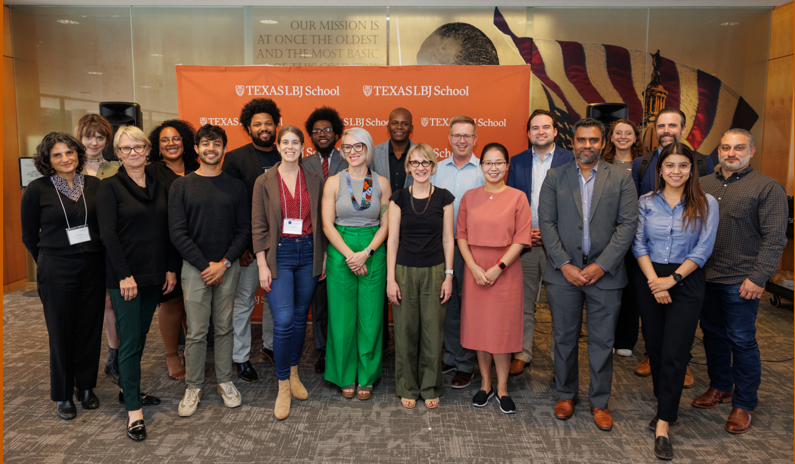
RGK faculty, staff, students, panelists and guest speakers at the Tech & Society Symposium, hosted at the LBJ School.